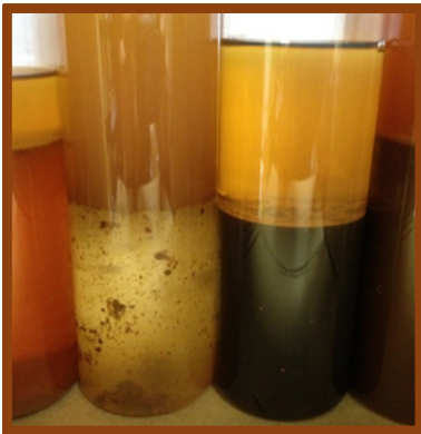
(The image above is of real fuel samples taken by Enertech Labs.)